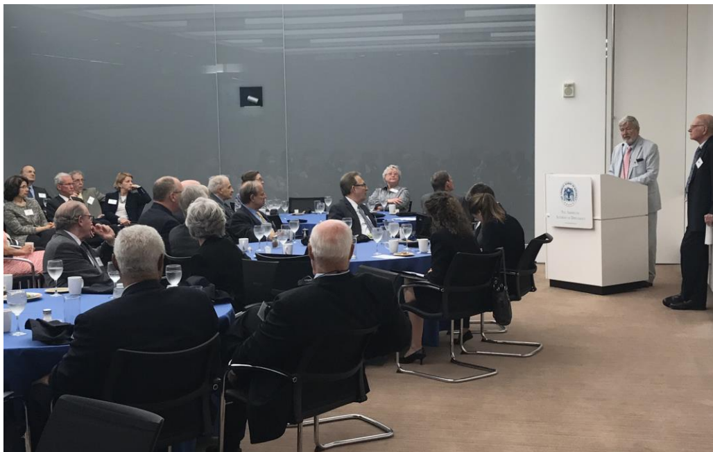
ACADEMY'S ANNUAL MEETING IN MAY 2017

After a presentation of the Academy's activities during the past year, as well as of the efforts carried out to protect the Institutions of Diplomacy, a Q&A session with members addressed the following issues: