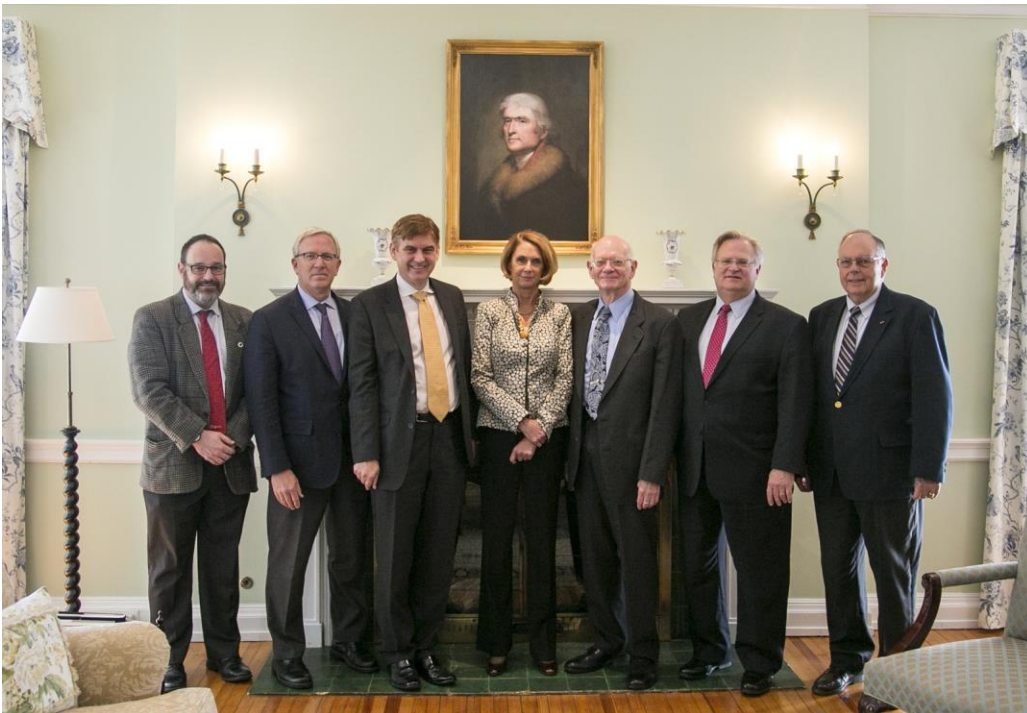
SPEAKERS AT MONTICELLO IN OCTOBER 2016