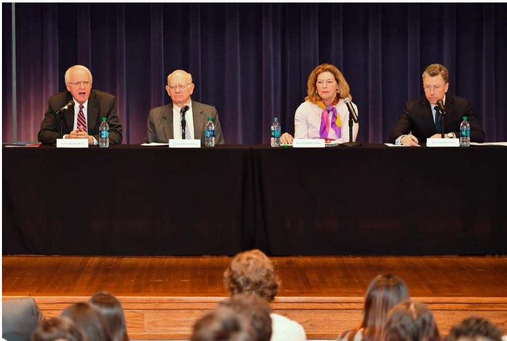
ACADEMY SPEAKERS AT TEXAS TECH UNIVERSITY