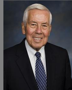
Richard Lugar (April 28, 2019)