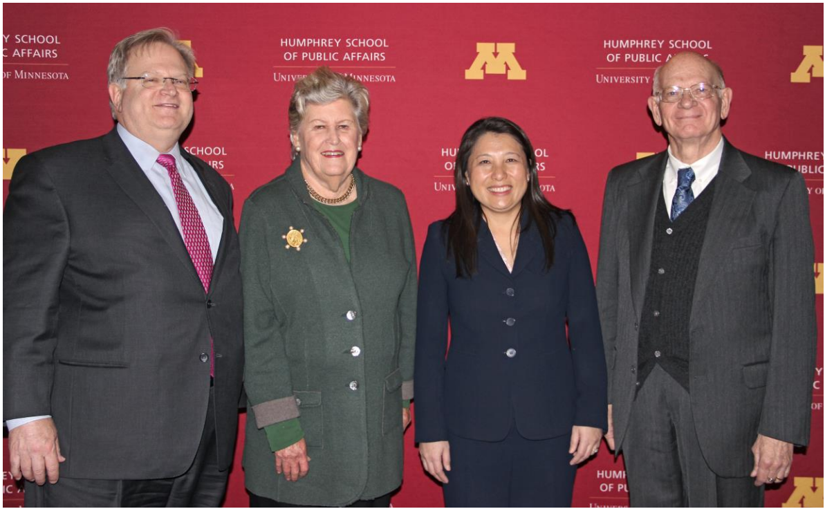
SISCO FORUM SPEAKERS AT THE UNIVERSITY OF MINNESOTA IN OCTOBER 2017