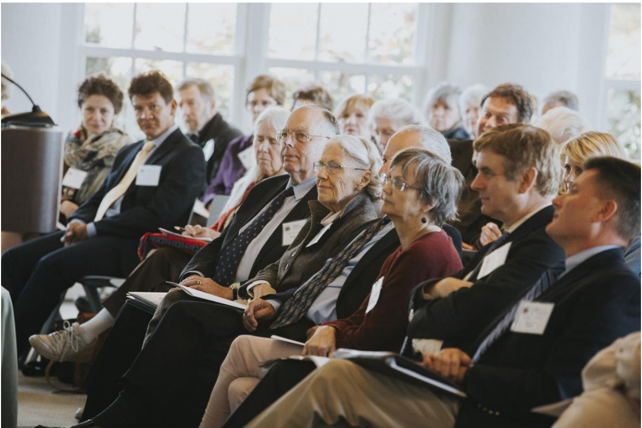
THE AUDIENCE AT MONTICELLO IN OCTOBER 2017, INCLUDING THE PROGRAM'S SPEAKERS