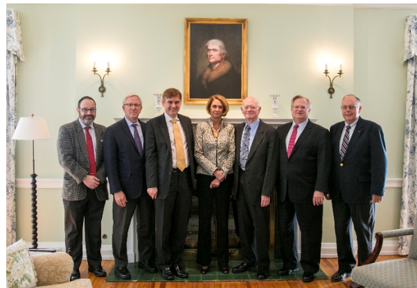
SPEAKERS AT MONTICELLO