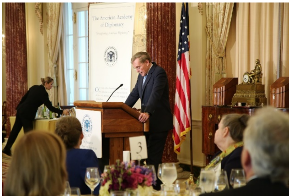
ROBERT ZOELICK RECEIVED THE ANNEBERG AWARD