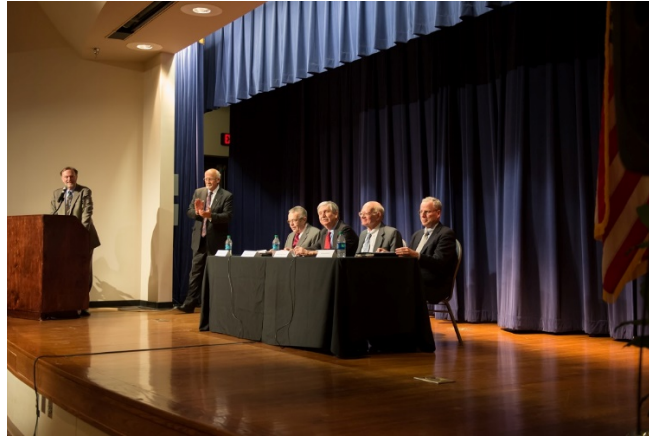
SPEAKERS AT TEXAS TECH UNIVERSITY